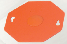
JUNCTION BOX COVER