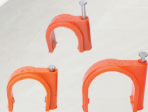
PIPE CLAMPS WITH CONCRETE NAILS