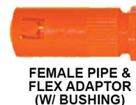
FEMALE PIPE & FLEX ADAPTOR (W/ BUSHING)